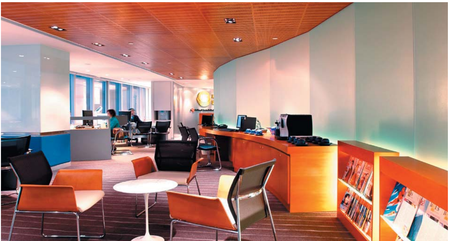
Bottom: The Customer Service Area - curves represent the waves of water and the flow of energy.