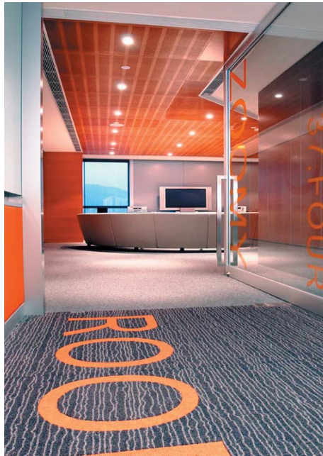
Opposite: The Focal Point - a three storey atrium was created, connecting staff and departments.