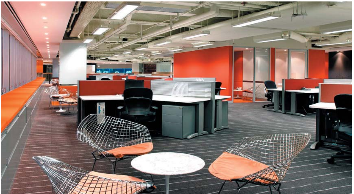
Bottom: Seating cushions were placed on top of low filing cabinets bordering windows to evolve the principles of transparency and community.