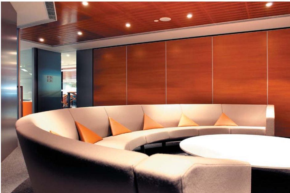
Opposite-Top: Ad-hoc meeting places with pull-down screens to separate areas if necessary.

The office is much more than the sum of its parts; it has become a tool for increased productivity, high morale and excellent client service.